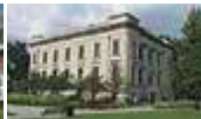
Indiana State University