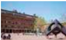
Western Washington University

These universities grant academic credit to students enrolled at them and can also grant transfer academic credit to students from other colleges who apply to the KCP program through them.