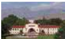
New Mexico State University