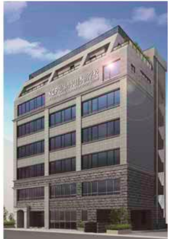
KCP Campus in the heart of Tokyo