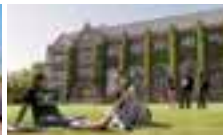
University of Idaho