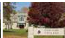
Rhode Island College