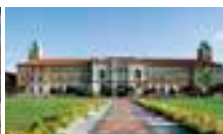
Texas Tech University