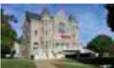
Virginia Union University